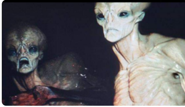
Photo of two evil grey extraterrestrials being interrupted while having a good time (probably). Leaked from CIA (guaranteed)... ... unless digital renders from Genesis 8 / Daz 3D app using Supreme Intelligence HD Alien Character model can transform into real living creatures.